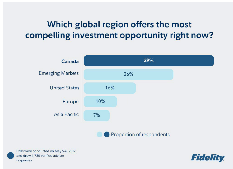
CHART: Regions advisors see as offering the most compelling investment opportunities right now

In their recent thought leadership paper, Conflict favours commodities and Canada , Fidelity’s Canadian Global Asset Allocation Team, who manage $118 billion on behalf of over one million Canadian investors, outlines how stronger global demand for commodities, combined with supply constraints, is benefiting reliable producers like Canada, and explains why they are overweight Canadian assets.