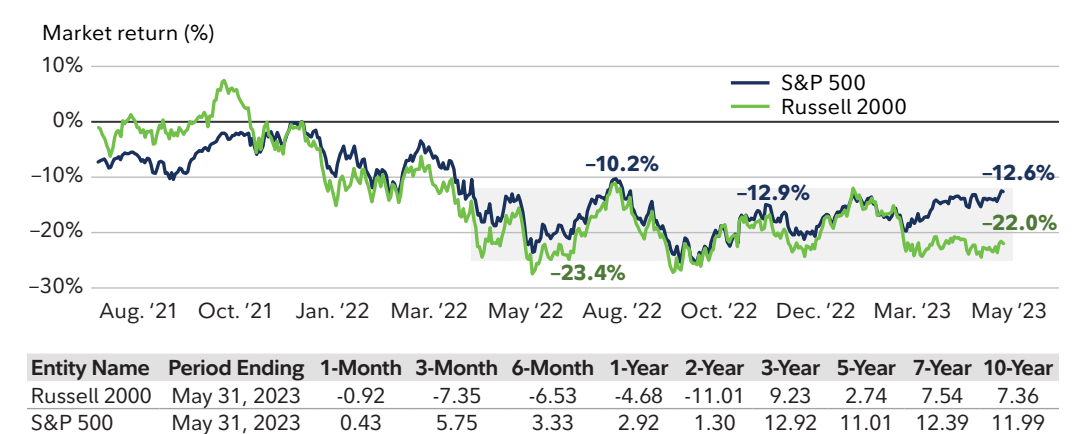
EXHIBIT 1: The market has spent a year in limbo

Past performance is no guarantee of future results. Returns indexed to zero as of the market's high in January 2022. See below for additional disclosures on the S&P 500 and Russell 2000.