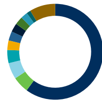
Country mix (%)